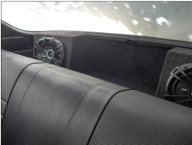
With the rear seatback up...