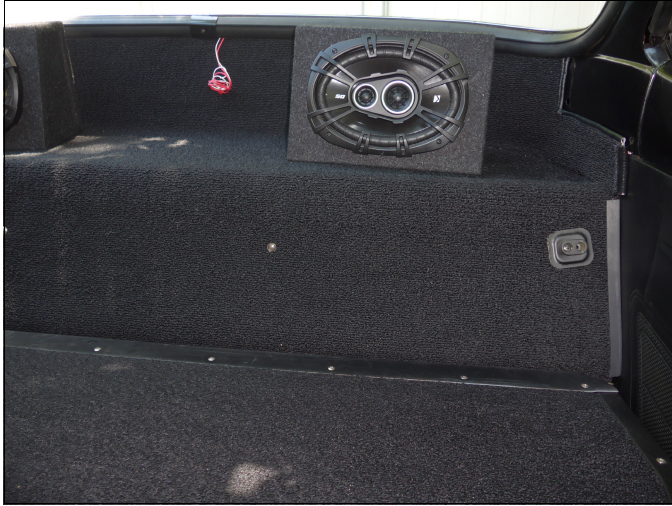
Carpet where there once was mere cardboard...