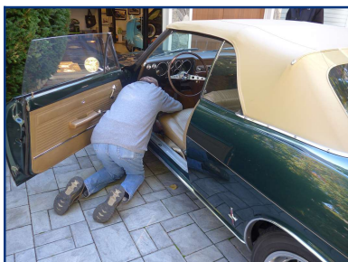
Tom Ludwig installs the new brake light switch

Gary also had a new switch which Tom Ludwig installed and the brake lights worked. After examining the engine compartment harness it was decided that the current harness was in good condition, not needing immediate replacement.