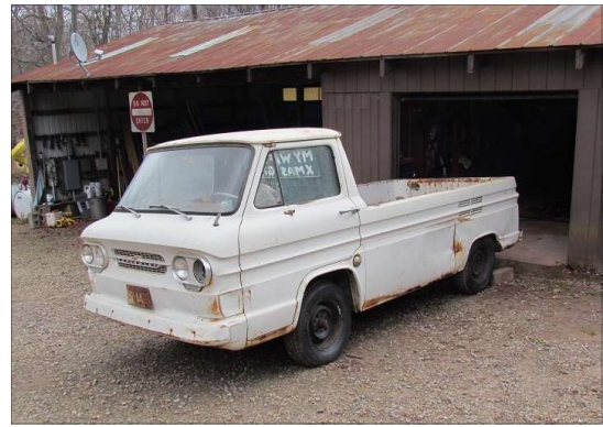
The Rampside arrives in Pennsylvania