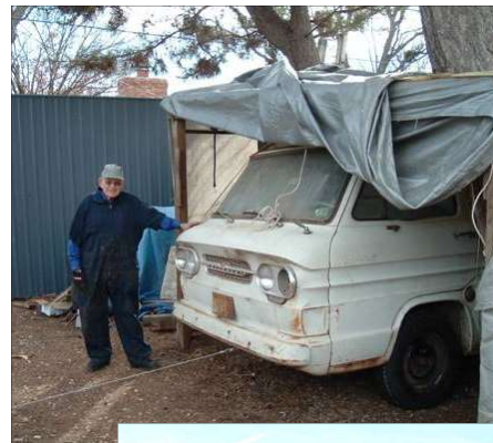
The 84-year-old original owner helps liberate the truck from it's 40-year-old parking spot

After driving 1600 miles there I was in Lubbock and looking at every panel, bumper, headlamp, door, and compartment of my Rampside. That is when I noticed the Texas license plate and the windshield state inspection sticker were both 40 years old. The seller who at the age of 84 made a mistake, after a little math I determined he drove it for 12 years then it sat for 40 years in his shed. I winched it up on my trailer, secured it with tow straps and began my 1600-mile trip back the Pennsylvania.