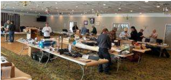
The layout !!! Parts for all years and models!