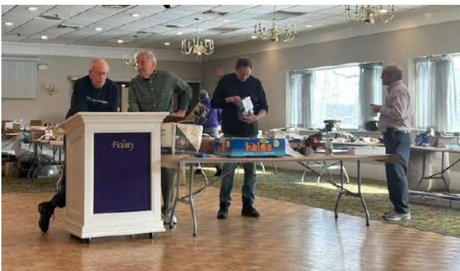
Let The Fun Begin!