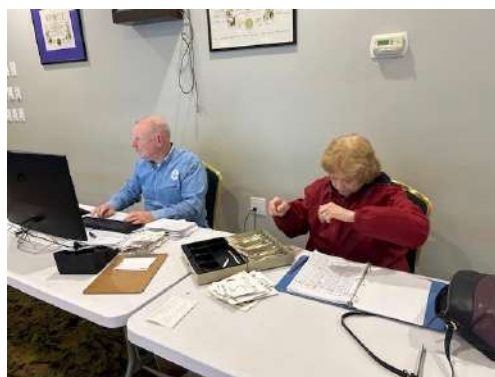
Our Fantastic Bookkeepers Hard At Work!