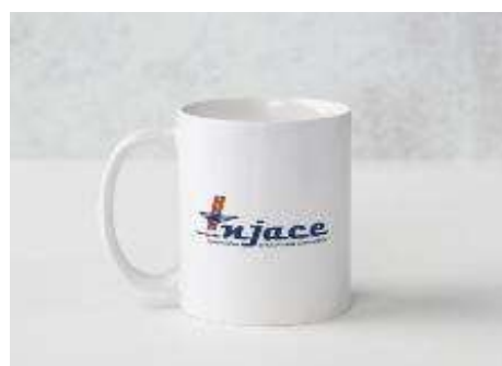
NJACE Two Sided Mug $15.00 + shipping