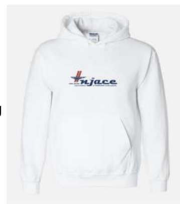
NJACE Hoodie All sizes $ 47.00 + shipping