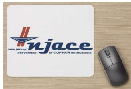
NJACE Mouse Pad $14.00 + shipping