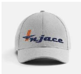
NJACE Embroidered Cap (one size) $20.00 + shipping