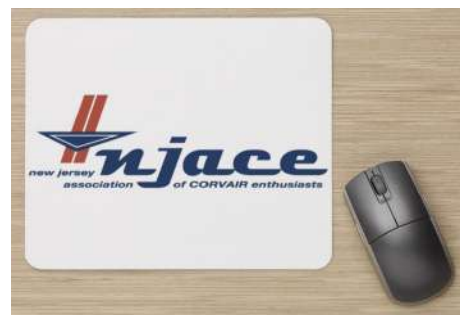
NJACE Mouse Pad $14.00 + shipping