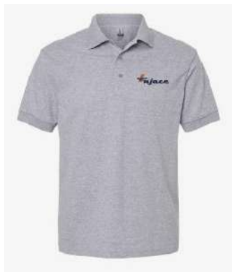
NJACE Embroidered Polo All sizes $42.00 + shipping