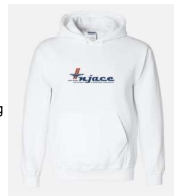
NJACE Hoodie All sizes $ 47.00 + shipping