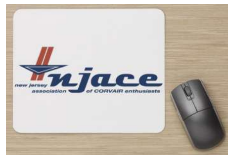
NJACE Mouse Pad $14.00 + shipping