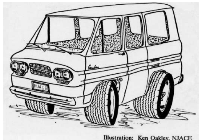
Illustration: Ken Oakley, NJACE