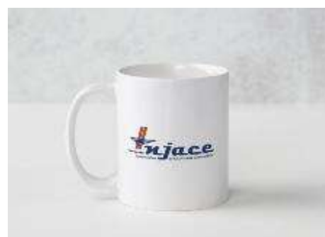
NJACE Two Sided Mug $15.00 + shipping