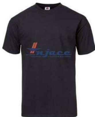
NJACE T-Shirts (available white or black) All sizes $23.00 + shipping