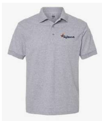
NJACE Embroidered Polo All sizes $42.00 + shipping