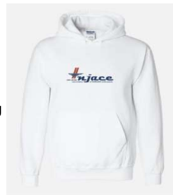
NJACE Hoodie All sizes $ 47.00 + shipping