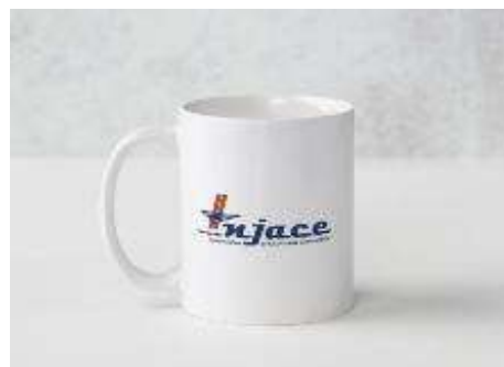
NJACE Two Sided Mug $15.00 + shipping