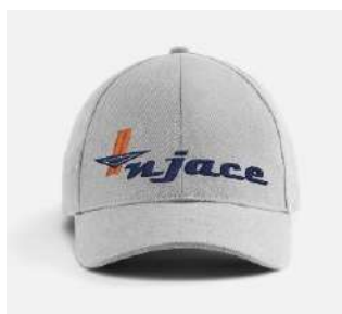
NJACE Embroidered Cap (one size) $20.00 + shipping