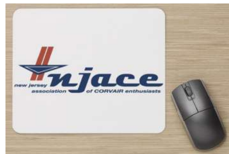
NJACE Mouse Pad $14.00 + shipping