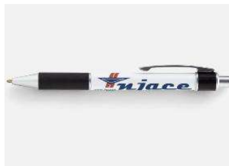
NJACE Pen $4.00 each + shipping