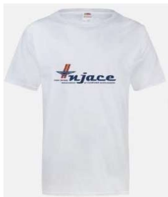
NJACE T-Shirts (available white or black) All sizes $23.00 + shipping