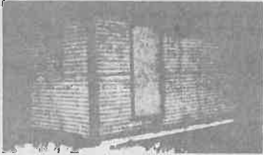
Wells Cargo dual axle trailer • Corvaire size

1976 GMC Sunland mini home, sleeps 4, air conditioner, bathtub and shower, gas and electric refrigerator, gas stove, automatic transmission, cruise control, 400 cu. engine, 24,718 miles - this unit is in A-1 condition.