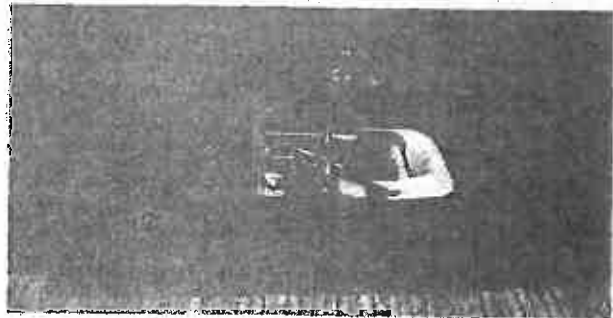
One of the first and one of the last Corvair convertibles (the latter with 27 7 miles on the odometer) owned by Pinky Randall of Houghton Lake, Michigan.

And what will the Corvair cultists do at their convention?