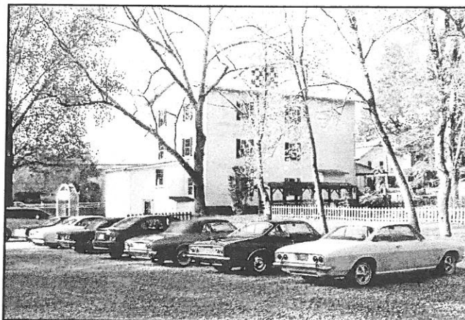
Our cars in the parking lot at Volant