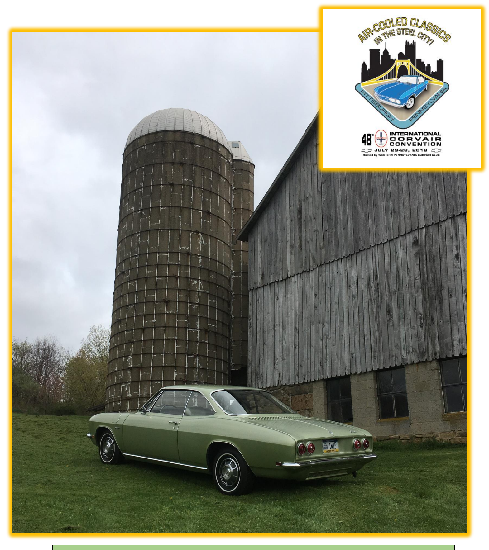
Here's a 1<sup>st</sup> look at our 2018 Convention Raffle Car... A clean, low mileage 1969 Corvair 500! Stay tuned for more pics and details.