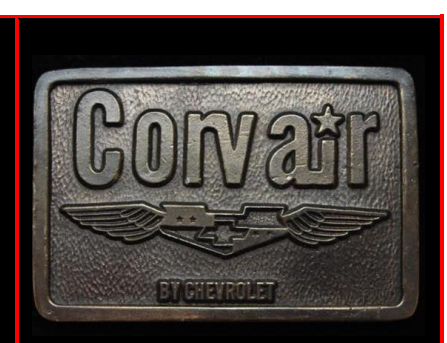
Found this NOS Corvair belt buckle made by Wyoming Art. Guess I need to buy a belt.