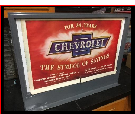
This is an 80's-90's era gas pump advertising top sign. I'll swap out the old Chevy magazine ad that was in it.