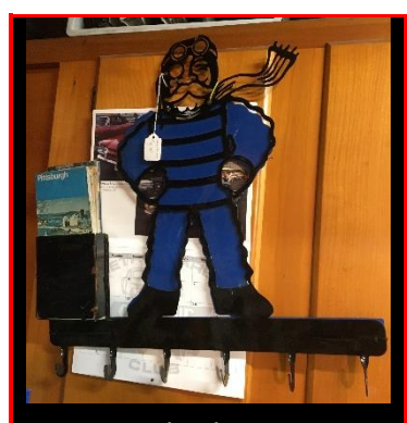
Does anybody recognize this character? I put some old maps in the pamphlet holder.