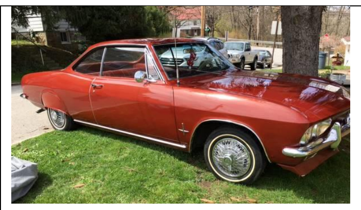
66 MONZA W/ PIMPIN' WHEEL COVERS! 84K miles. Excellent condition...Greensburg, PA. Asking $4,500 obo...EMAIL

WTB – Tim Desmond is looking for a tach for his 1965 Corsa. 412-952-9753